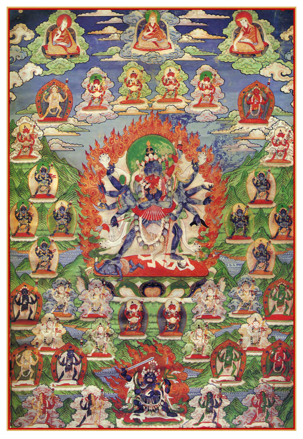
62-DEITY CHAKRASAMVARA SADHANA in the the Luipa Tradition